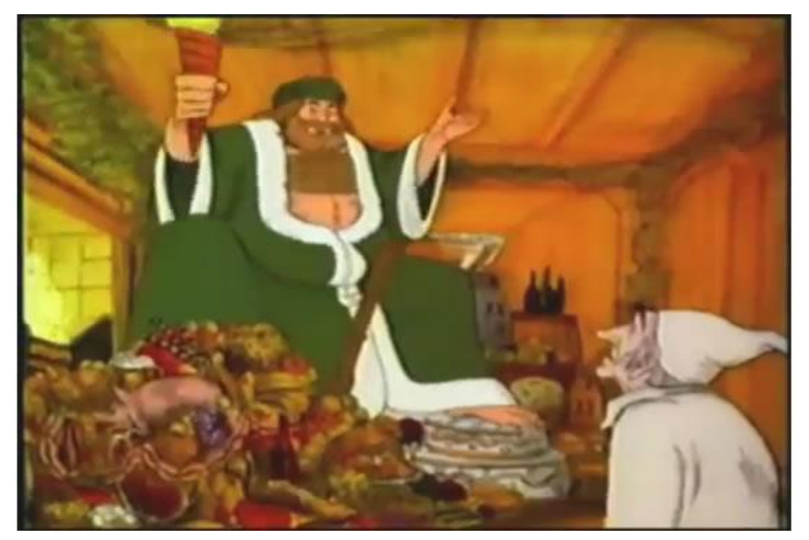
Only to be awoken by the ghost of Christmas present.